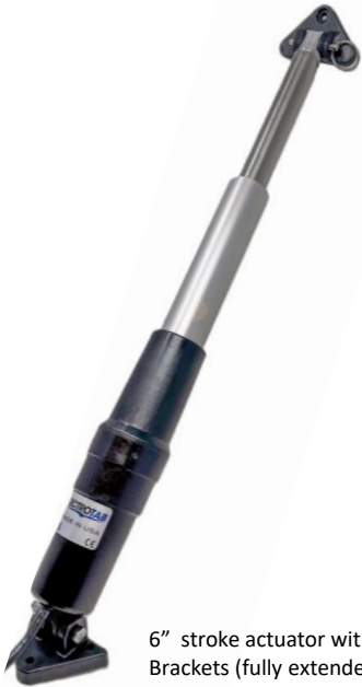
6" stroke actuator with Brackets (fully extended)

Marine linear actuators are ideal for hatch lifts, engine covers, automated ventilation covers, seat adjustment and a variety of other marine applications. They are available in stroke lengths from 4" (101.6 mm) to 24" (610 mm). Lectrotab linear actuators are designed to perform in the same extreme marine environment as the Lectrotab trim tab actuators and are precision-engineered to combine quiet operation with a non-hydraulic, maintenance free design. They ensure accurate positioning, provide maximum lift force, and are totally self-contained for easy installation. The actuators accept a variety of mounting brackets and hardware to adapt to most installations and brands and provide access during a loss of power. All extended length actuators come in 12 and 24 VDC.