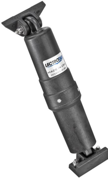
Short Actuator with Low Profile Bracket

Ideal for limited vertical height applications such as swim platforms, Lectrotab short trim tab actuators are precision-engineered to combine quiet operation with a non-hydraulic, maintenance free design. The unit is corrosion free, ensures very accurate tab positioning, provides maximum lift force, and is totally self-contained for easy installation. The actuator assembly is packaged in a non-metallic permanently sealed housing. No components need to be installed inside the boat. Most importantly, unlike hydraulic trim tabs, there is no oil to leak out. The short actuator incorporates either a standard or low profile (see picture) transom mounting bracket. Short actuators come in 12 and 24 VDC with 6 second stroke time.